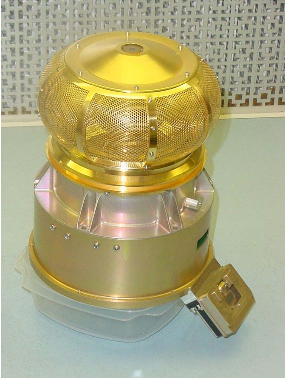
Fig 1. FM1 SWEA/STE-D